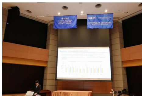
Students presented their researches.