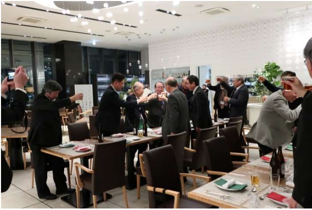
Twenty-two participated the get-together