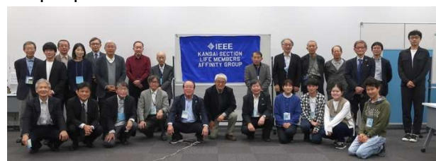
Twenty-five persons participated.