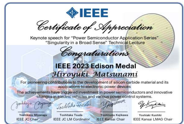
Plaques of the certificate of appreciation.