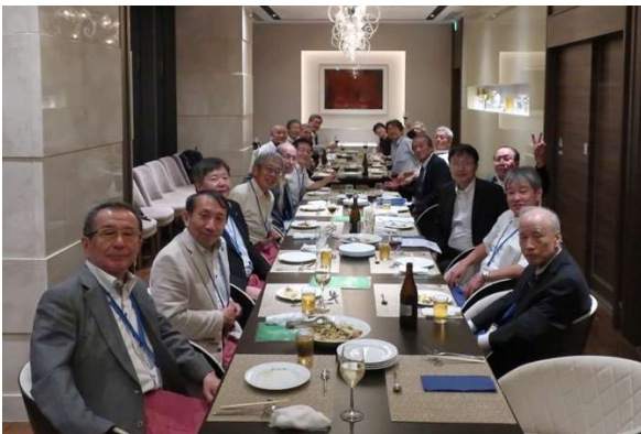
Nineteen people joined the get-together.

After the lecture, we enjoyed a talk about the milestone technologies at a restaurant on top of the campus building.