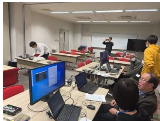
Hands-on practice by IEEE members.

As information security becomes more important on a daily basis, physical- and upper-layer security are becoming major concerns. In fact, the ever increasing precision and price drop of measuring devices along with the increasing speed and memory of computers, enables high-level attacks that used to be technically difficult to achieve. Such attacks represent threats not only to the military and diplomatic areas, but also to commerce and industry. With focus on physical-layer security, the ISE (Information Security Engineering) Laboratory conducts research and development concerning information leakage mechanisms and their countermeasures, as well as research on overall system security including the upper hardware-based layer.