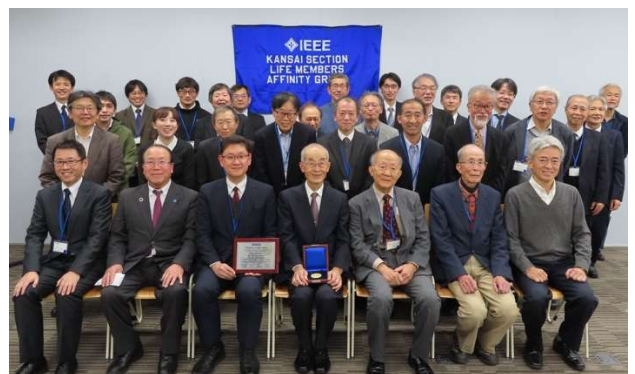
213 persons attended, on-site and online.

The attendees were very impressed by the lecture and the sample of SiC wafer displayed in the lecture room. Active questions and discussions about his research and possible future applications followed.